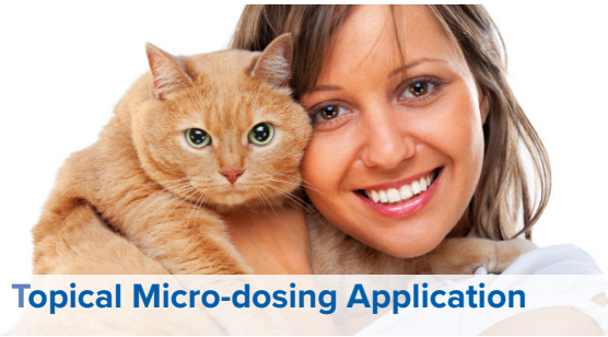
Topical Micro-dosing Application