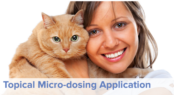
Topical Micro-dosing Application